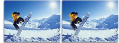
2ms GtG response time > 2ms GtG response time

SmartResponse is an exclusive Philips overdrive technology that when turned on, automatically adjusts response times to specific application requirements like gaming and movies which require faster response times in order to produce judder, time-lag and ghost image free images