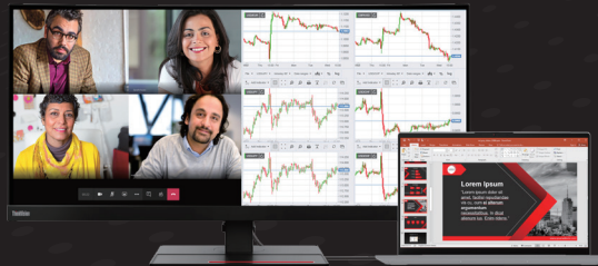
Master the art of multi-tasking

The P34w-20 kicks your work up a notch with outstanding visuals to show accurate colors from any angle. With WQHD 3440 x 1440 resolution, the monitor helps you capture even the smallest details while seeing true-to-life color with a 99% sRGB color calibration Delta E<2. Designed to impress, the 2 x 3W built-in speakers offer immersive audio that is true to your ears. The P34w-20 is also created with your health and comfort in mind, with eye-care and Natural Low Blue Light technology to reduce harmful high energy blue light emissions. Adjust the monitor height up to 150 mm to suit your ideal working style or position. Meanwhile, Lenovo ThinkColour 2 software allows you to easily and quickly adjust your screen settings with a simple click to enhance your work efficiency and optimize your monitor's extensive capabilities. Lenovo patented features, such as LAN on ThinkColour, show the network status from the screen to facilitate a more seamless workflow.