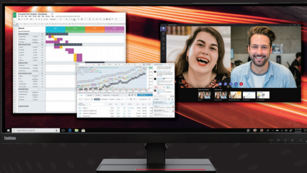
An eye – and ear – for detail

The P34w-20 kicks your work up a notch with outstanding visuals to show accurate colors from any angle. With WQHD 3440 x 1440 resolution, the monitor helps you capture even the smallest details while seeing true-to-life color with a 99% sRGB color calibration Delta E<2. Designed to impress, the 2 x 3W built-in speakers offer immersive audio that is true to your ears. The P34w-20 is also created with your health and comfort in mind, with eye-care and Natural Low Blue Light technology to reduce harmful high energy blue light emissions. Adjust the monitor height up to 150 mm to suit your ideal working style or position. Meanwhile, Lenovo ThinkColour 2 software allows you to easily and quickly adjust your screen settings with a simple click to enhance your work efficiency and optimize your monitor's extensive capabilities. Lenovo patented features, such as LAN on ThinkColour, show the network status from the screen to facilitate a more seamless workflow.