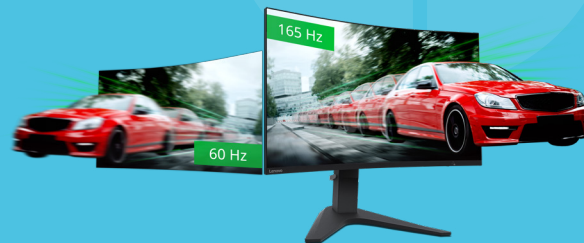
165 Hz Refresh rate

The G27c has a curvature of 1500R that fills your peripheral, offering complete immersion in the game you are playing—so you can enjoy every slight movement. Coupled with a VA panel, this monitor offers wide viewing angle, high screen brightness, and an excellent contrast ratio that further improves game visuals.