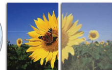
With SmartImage Without SmartImage

SmartImage is an exclusive leading edge Philips technology that analyzes the content displayed on your screen and gives you optimized display performance. This user friendly interface allows you to select various modes like Office, Photo, Movie, Game, Economy etc., to fit the application in use. Based on the selection, SmartImage dynamically optimizes the contrast, color saturation and sharpness of images and videos for ultimate display performance. The Economy mode option offers you major power savings. All in real time with the press of a single button!