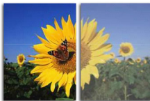
With SmartImage Without SmartImage

SmartImage is an exclusive leading edge Philips technology that analyzes the content displayed on your screen and gives you optimized display performance. This user friendly interface allows you to select various modes like Office, Image, Entertainment, Economy etc., to fit the