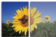
With SmartImage Without SmartImage

SmartImage is an exclusive leading edge Philips technology that analyzes the content displayed