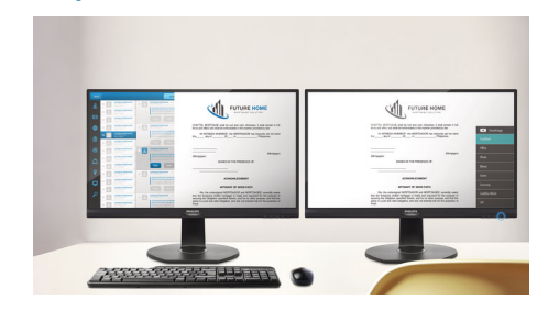
EasyRead mode for a paper-like reading