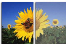
With SmartImage Without SmartImage

SmartImage is an exclusive leading edge Philips technology that analyzes the content displayed on your screen and gives you optimized display performance. This user friendly interface allows you to select various modes like Office, Image, Entertainment, Economy etc., to fit the