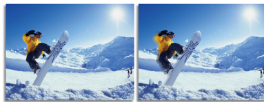
2ms GtG response time > 2ms GtG response time

SmartResponse is a exclusive Philips overdrive technology that when turned on, automatically adjusts response times to specific application requirements like gaming and movies which